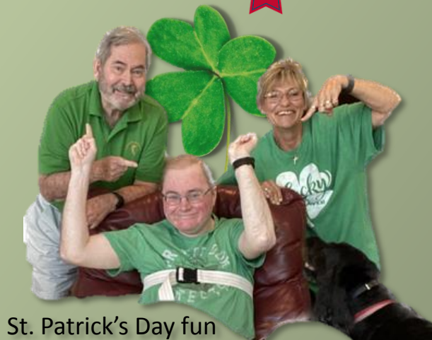
St. Patrick's Day fun