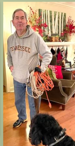
Cable Guy "pre-beard"