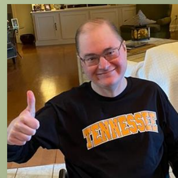
Big Tennessee fan