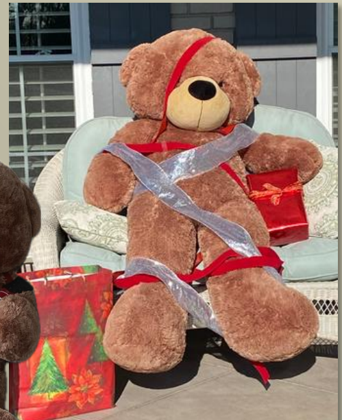
BEAR is a big hit during Christmas