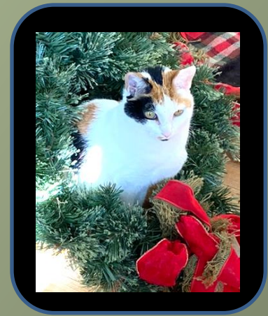
Lil Bit in wreath