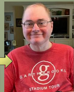
Garth Brooks t-shirt