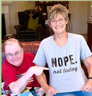
NOPE, not today