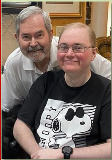
One of my favorite photos