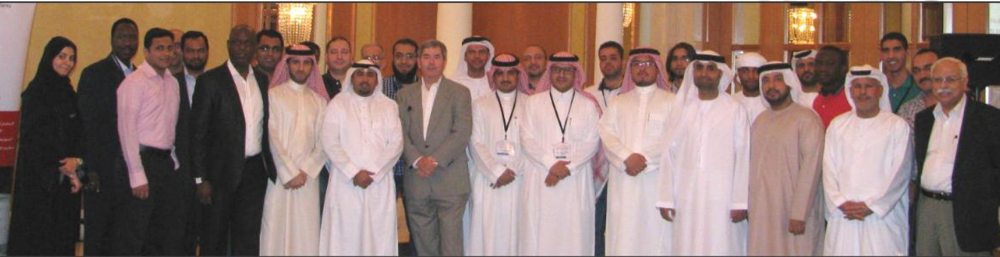
IT Manager Institute #56 – 2013 – Dubai, United Arab Emirates