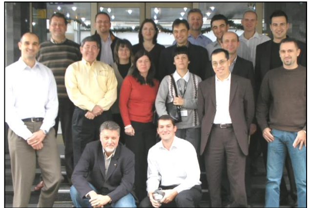
IT Manager Institute #21 - 2006 Ljubljana, Slovenia

Budgeting is quick and easy when you have a process and tools to help you do the job plus insight in how to create budgets you can achieve.