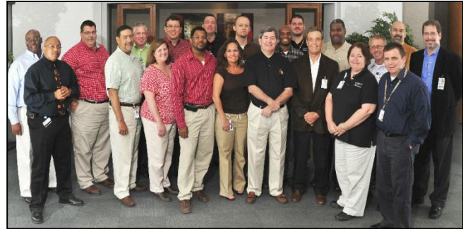
IT Manager Institute #33 - 2009 Atlanta, GA