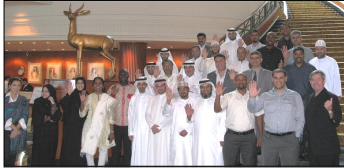
IT Manager Institute #53 - 2012 Dubai, UAE