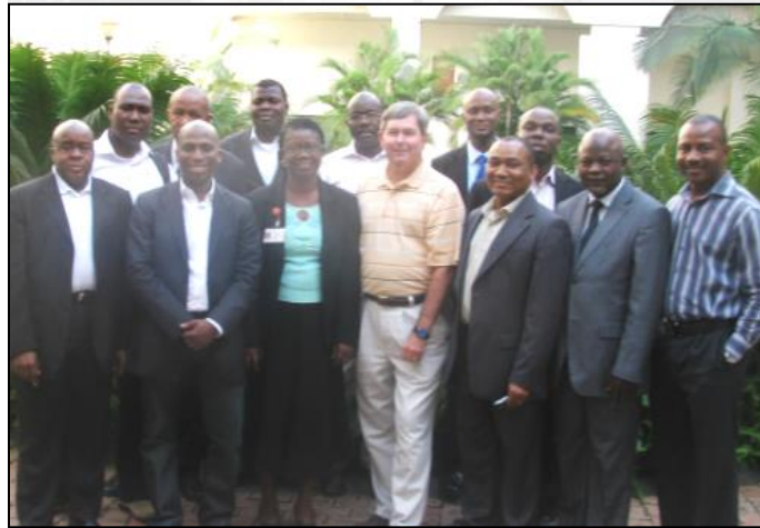
IT Manager Institute #35 - 2009 Abuja, Nigeria