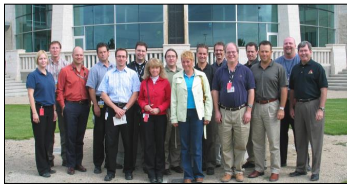
IT Manager Institute #12 - 2005 Regina, Saskatchewan Canada