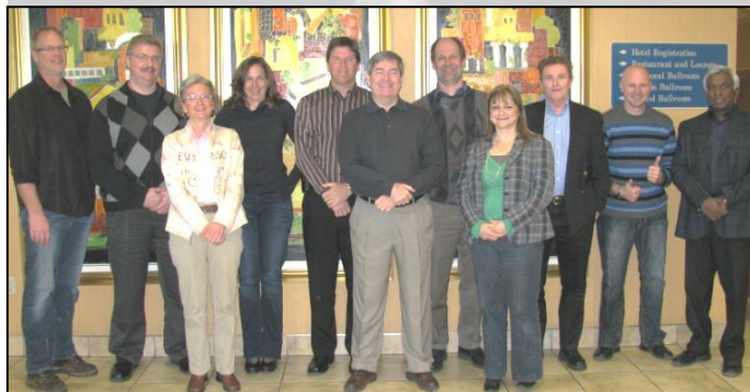
IT Manager Institute #45 - 2011 London, Ontario Canada